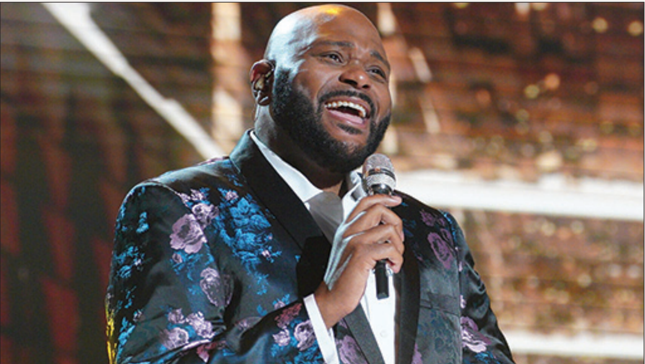
"American Idol" winner Ruben Studdard headlines "Ruben Studdard Sings Luther Vandross" Nov. 21-22 at Knight Theatre.