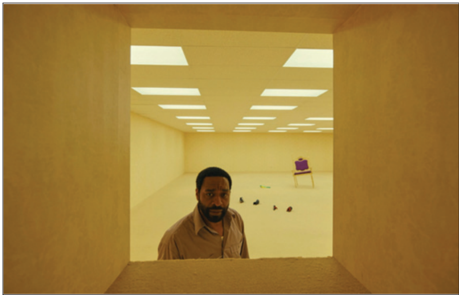
Chiwetel Ejiofor in a scene from the psycho-horror thriller "Backrooms," an A24 production.

They melt the series, which received 216 million views, into a one-hour, 50-minute tightly woven storyline that looks innocent at first. Like a guy down on his luck sees an opportunity to explore and gets caught in the wrong places. Wait. Just you wait. At some