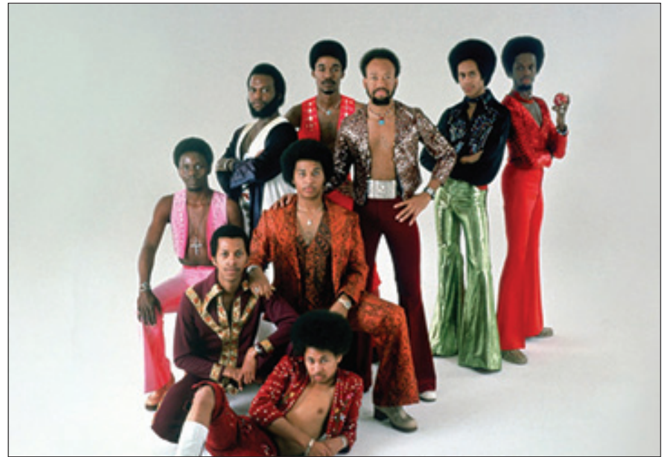
TRIBECA FILM FESTIVAL

Visit film critic Dwight Brown at DwightBrownInk.com .