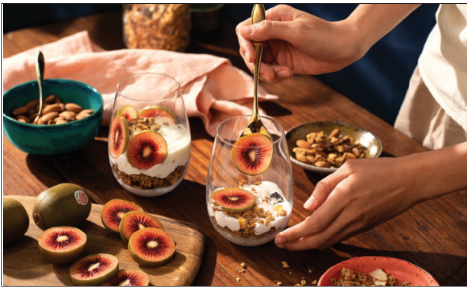
Red kiwi yogurt parfait.