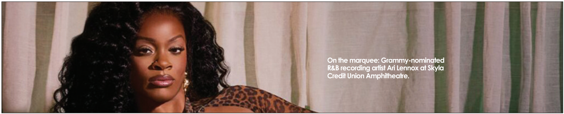
On the marquee: Grammy-nominated R&B recording artist Ari Lennox at Skyla Credit Union Amphitheatre.

THE VOICE OF THE BLACK COMMUNITY SINCE 1906