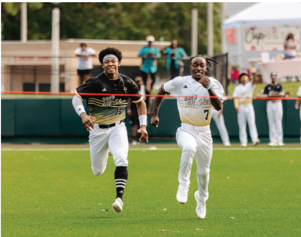
MINORITY PROSPECTS BASEBALL

The annual Black college baseball and softball showcase returns for games, fastest-man and fastest-woman competitions and a symposium June 4-6 in Charlotte and Kannapolis.