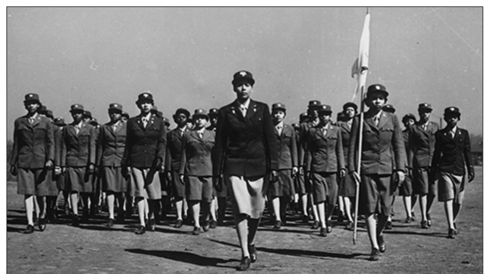
ARMY WOMEN'S FOUNDATION

The 6888th Central Postal Directory Battalion, the only all-Black Women's Army Corps unit to serve overseas during World War II, marches in formation.