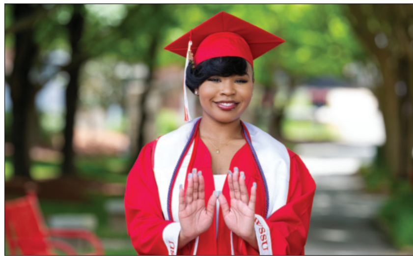
WINSTON-SALEM STATE UNIVERSITY