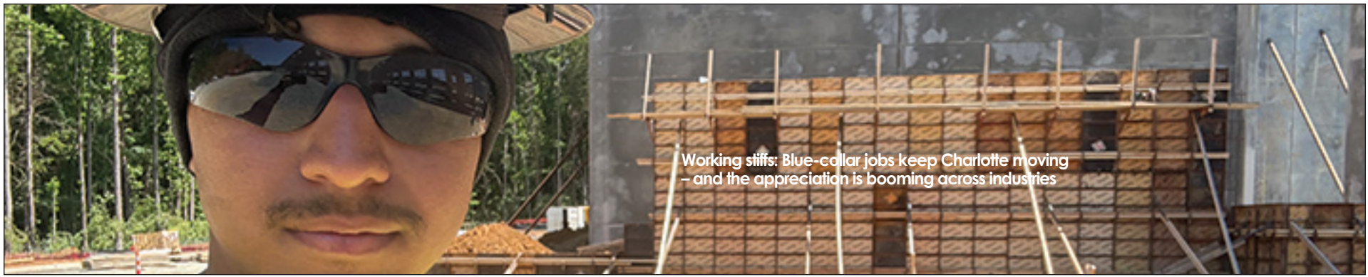
Working stiffs: Blue-collar jobs keep Charlotte moving — and the appreciation is booming across industries

THE VOICE OF THE BLACK COMMUNITY SINCE 1906