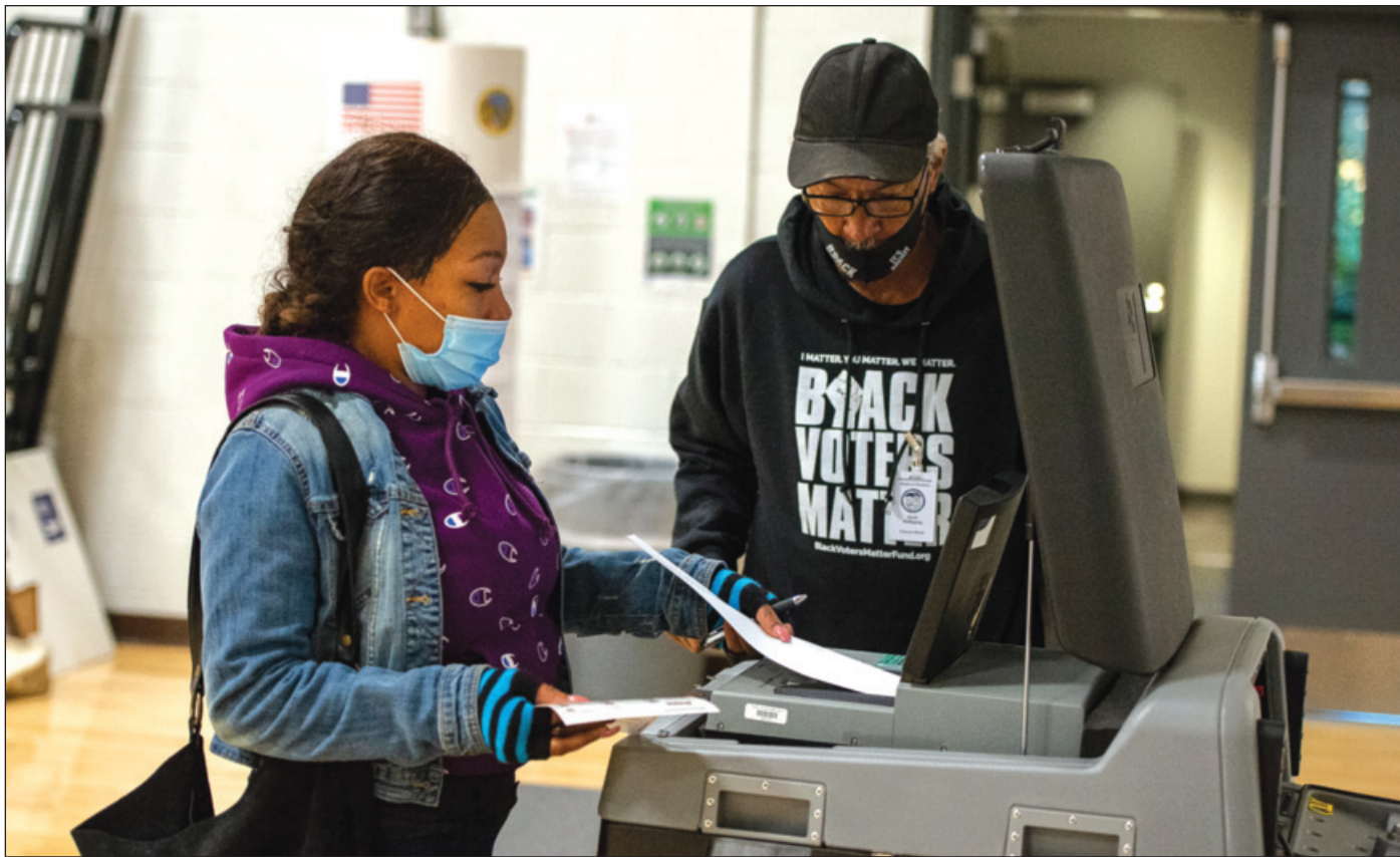
TROY HULL | THE CHARLOTTE POST

Last week's Supreme Court decision to gut Section 2 provisions of the Voting Rights Act of 1965 opens the door for states to create party gerrymanders that limit representation of communities of color. The impacts will be most profound in southern states like North Carolina.