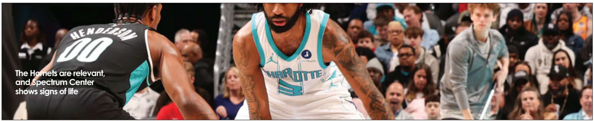
The Hornets are relevant, and Spectrum Center shows signs of life

THE VOICE OF THE BLACK COMMUNITY SINCE 1906