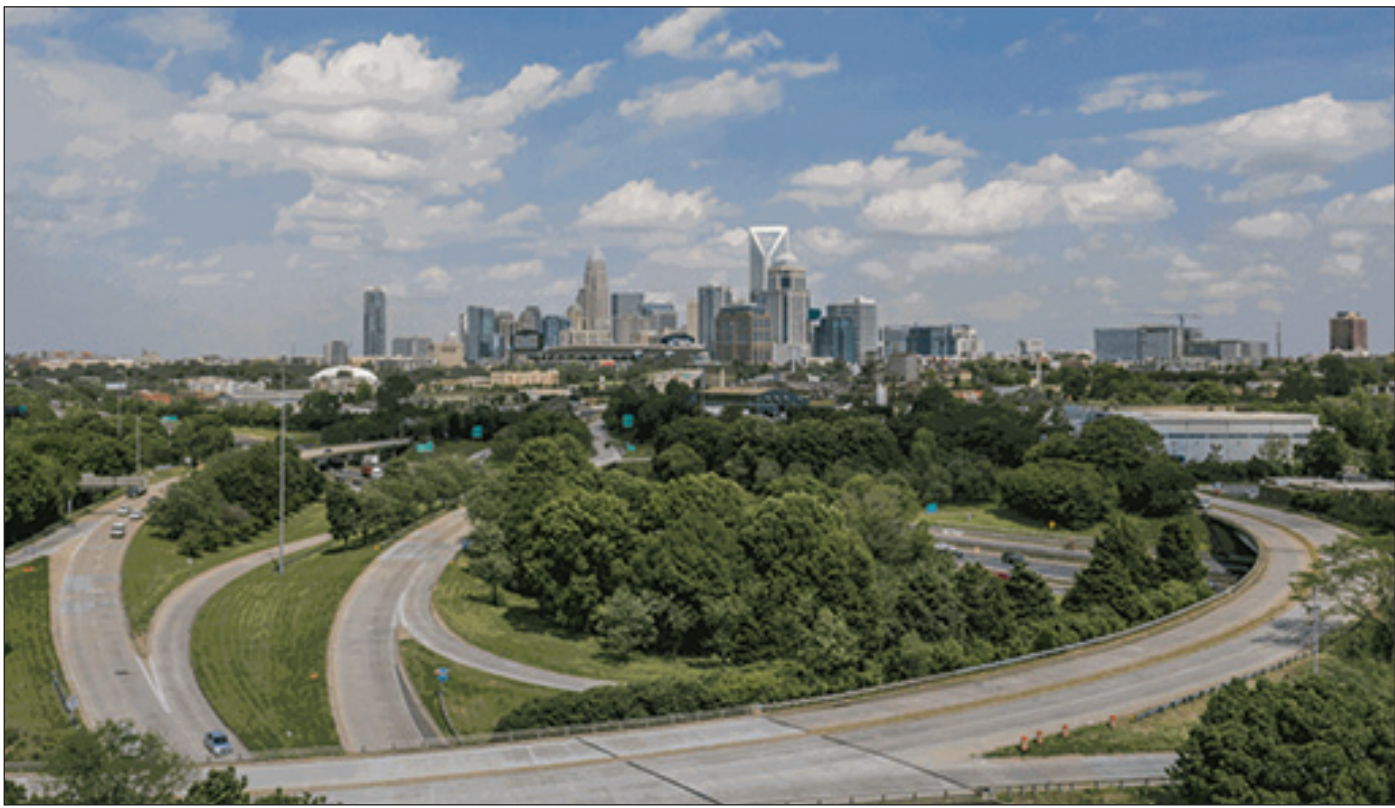
CITY OF CHARLOTTE