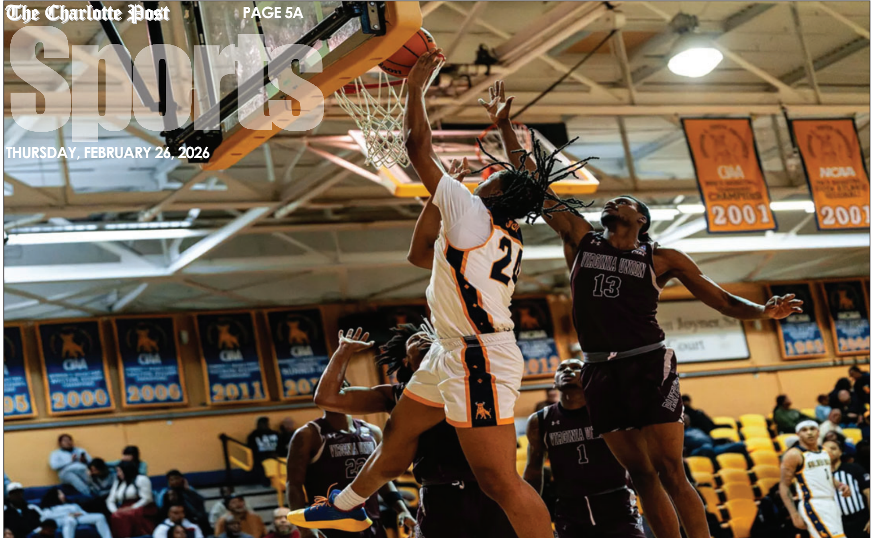
JOHNSON C. SMITH ATHLETICS

Johnson C. Smith basketball is a long shot to hoist the CIAA basketball tournament trophy in Baltimore while Virginia Union is a favorite along with rival Virginia State and Bluefield State.