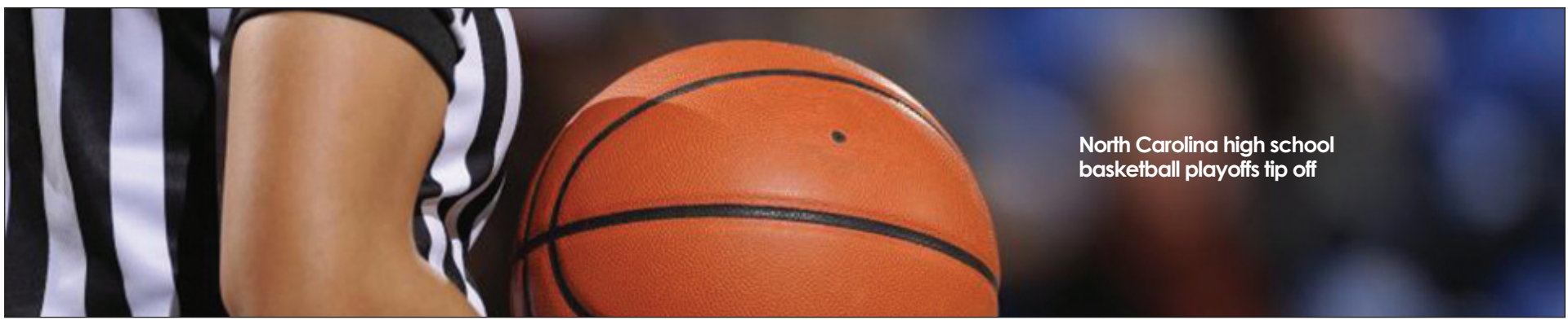
North Carolina high school basketball playoffs tip off

THE VOICE OF THE BLACK COMMUNITY SINCE 1906